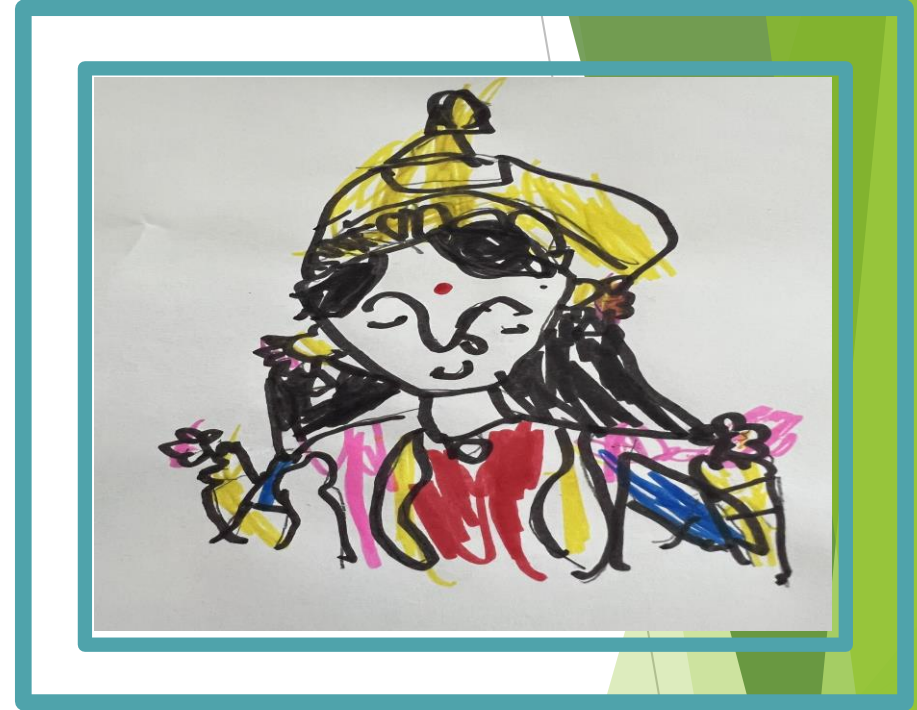
Goddess Lakshmi - Sketch by Varshini Emani